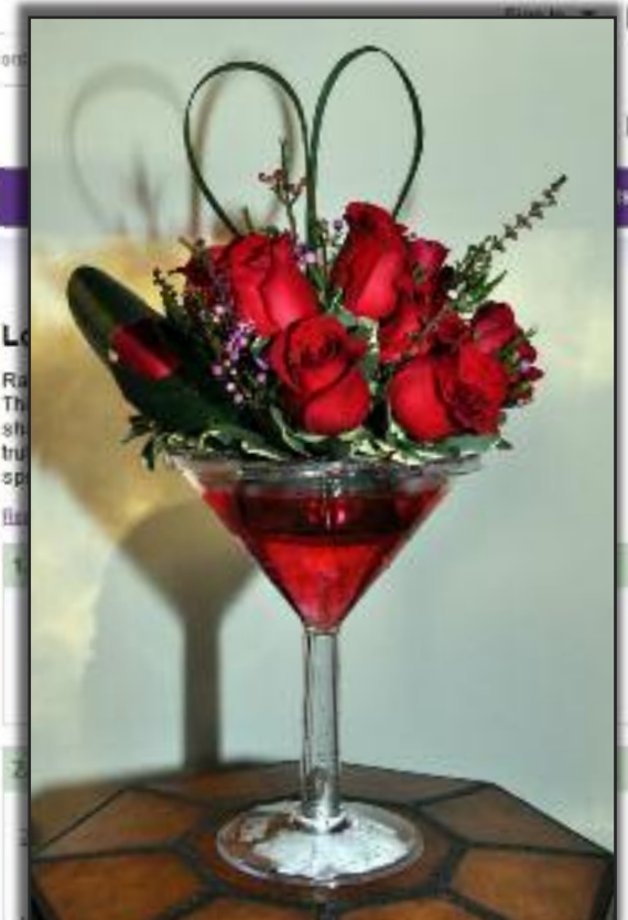
Lamorinda Weekly ordered flowers online and received them on time. Though the arrangement looked similar to what was ordered, it contained fewer roses than shown online, and the $88 final cost included a $14.99 service charge.