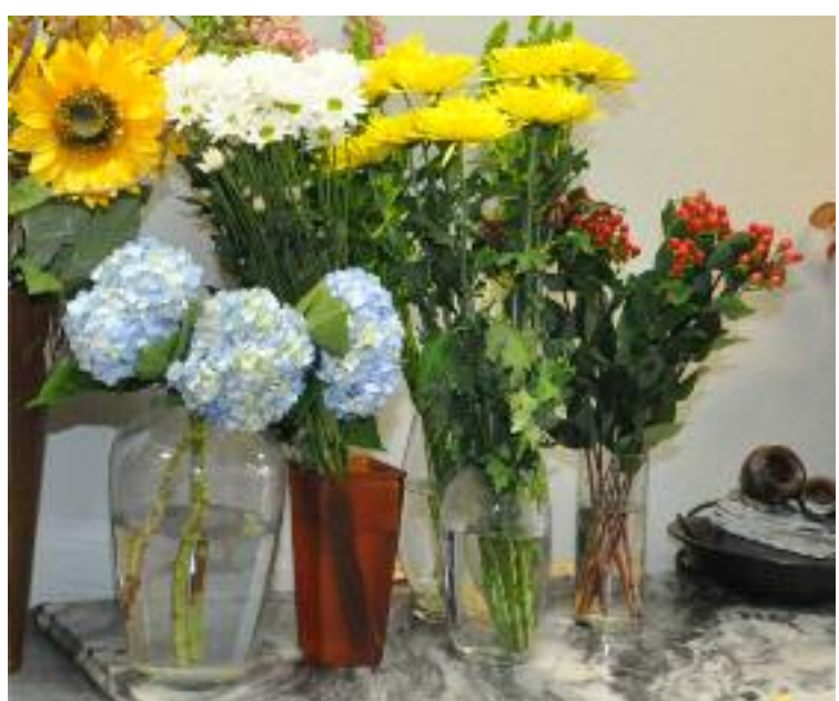
Flowers sit in vases, awaiting orders at King Florist and Gifts in Moraga.

If the florist turns them down, they and Teleflora, a delivery service out call the customer and say they can't fill the order." That would not be a emails seeking comment. pleasant phone call for a customer to